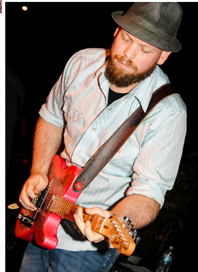
The Church of Blues (keyboards/top; guitar/left) has the crowd dancing the night away!